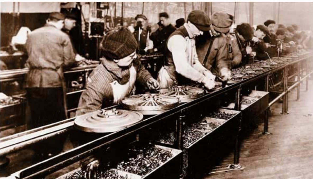
◀ Workers at the Ford flywheel factory cope with the demanding pace of the assembly line to earn five dollars a day—a good wage in 1914.