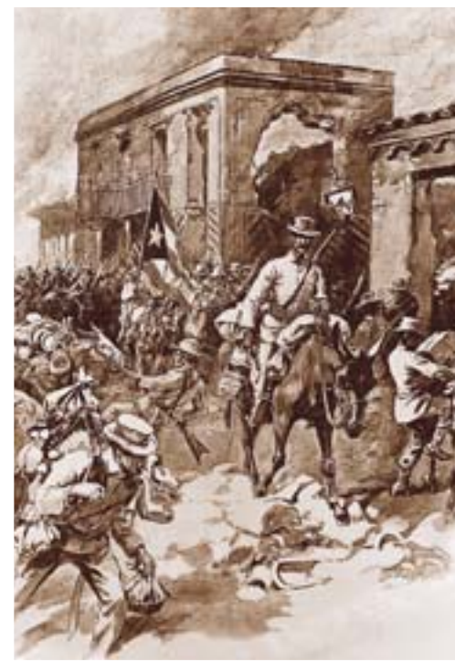
▲ Cuban rebels burn the town of Jaruco in March 1896.

Newspapers during that period often exaggerated stories like Creelman’s to boost their sales as well as to provoke American intervention in Cuba.