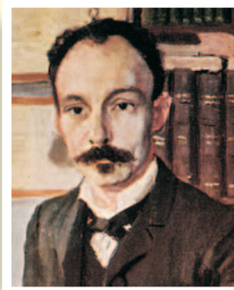
JOSÉ MARTÍ 1853–1895

The Cuban political activist José Martí dedicated his life to achieving independence for Cuba. Expelled from Cuba at the age of 16 because of his revolutionary activities, Martí earned a master’s degree and a law degree. He eventually settled in the United States.