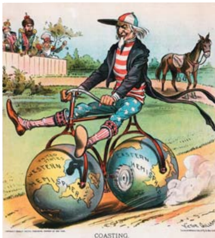
▲ This lithograph criticizes American foreign policy in 1898. In the cartoon, Uncle Sam is riding a bicycle with wheels labeled “western hemisphere” and “eastern hemisphere.” He has abandoned his horse, on whose saddle appears “Monroe Doctrine,” because the horse is too slow.

On February 6, 1899, the annexation question was settled with the Senate’s approval of the Treaty of Paris. The United States now had an empire that included Cuba, Guam, Puerto Rico, and the Philippines. The next question Americans faced was how and when the United States would add to its dominion.