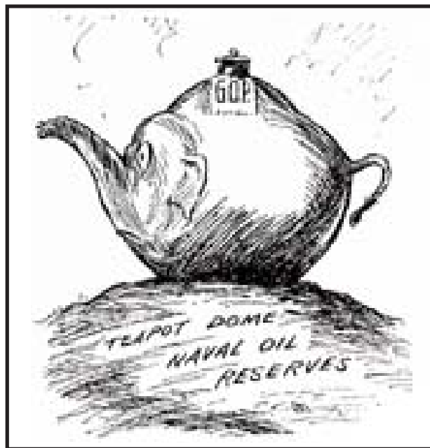
▲ The elephant, shaped like a teapot here, is the symbol of the Republican Party (Grand Old Party). The cartoonist implies that Republicans were responsible for the Teapot Dome scandal.

Americans sincerely mourned their good-natured president. The crimes of the Harding administration were coming to light just as Vice-President Calvin Coolidge assumed the presidency. Coolidge, a respected man of integrity, helped to restore people's faith in their government and in the Republican Party. The next year, Coolidge was elected president.