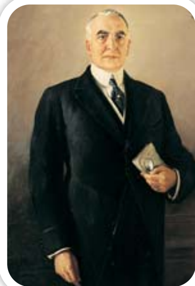
▲ Warren G. Harding, shown here in 1923, looked presidential, but he is considered one of the least successful presidents.

Despite Harding's soothing speeches, his judgment turned out to be poor. The discord among the major world powers and the conduct within his own cabinet would test his politics and his character.