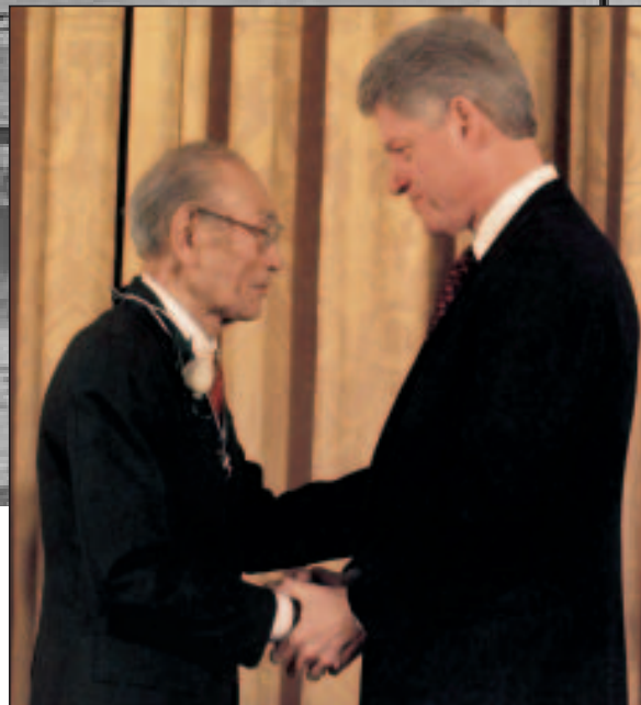
▲ President Clinton presents Fred Korematsu with a Presidential Medal of Freedom during a ceremony at the White House on January 15, 1998.

In the end, the internment of Japanese Americans became a national embarrassment. In 1976, President Gerald R. Ford repealed Executive Order 9066.