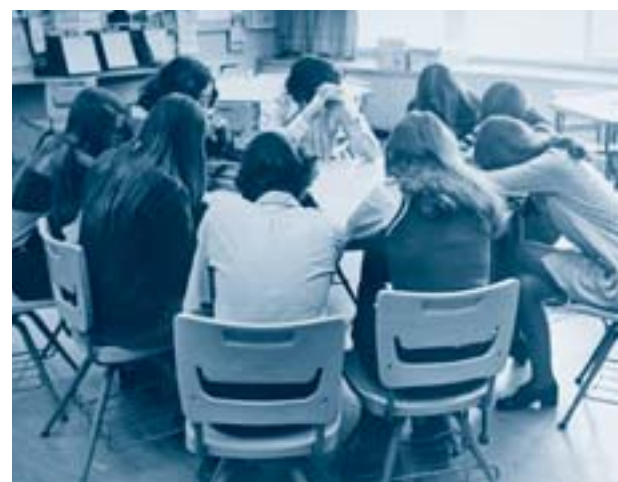
▲ Several high school students in New York hold a prayer meeting in 1973.

THE MORAL MAJORITY Religion, especially evangelical Christianity, played a key role in the growing strength of the conservative coalition. The 1970s had brought a huge religious revival, especially among fundamentalist sects. Each week, millions of Americans watched evangelist preachers on television or listened to them on the radio. Two of the most influential televangelists were Jerry Falwell and Pat Robertson. Falwell formed an organization called the Moral Majority . The Moral Majority consisted mostly of evangelical and fundamentalist Christians who interpreted