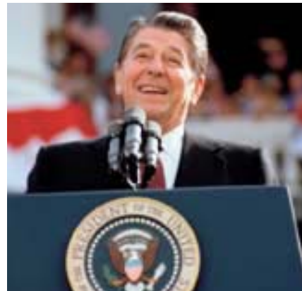
President Ronald Reagan

Throughout the 1980 presidential campaign and in the early days of his administration, President Reagan emphasized the perilous state of the economy during the Carter administration. In a speech to the nation on February 5, 1981—his first televised speech from the White House—Reagan announced his new economic program. He called for a reduction in income tax rates for individuals and a big reduction in government spending.