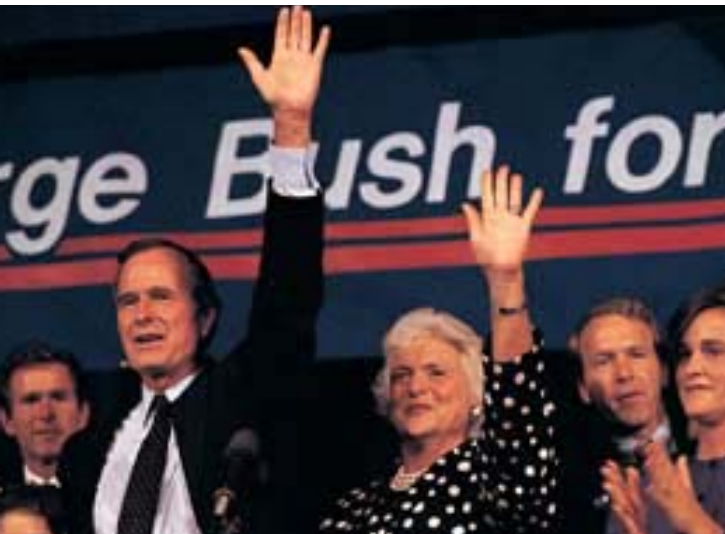
◀ George Bush announces his presidential candidacy at a rally in 1987.