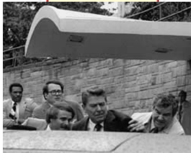
▲ President Reagan is pushed into a presidential limousine after being shot by a deranged man.

On March 30, 1981, President Reagan and other members of his staff were shot by a mentally unbalanced man named John Hinckley, Jr. While being wheeled into surgery to have a bullet removed, the president said to his wife, "Honey, I forgot to duck" (a line first used by boxer Jack Dempsey in the 1920s, after being knocked out in a bout). In the operating room, Reagan said to the team of surgeons, "I hope you fellas are Republicans." Reagan recovered speedily and his popularity grew.